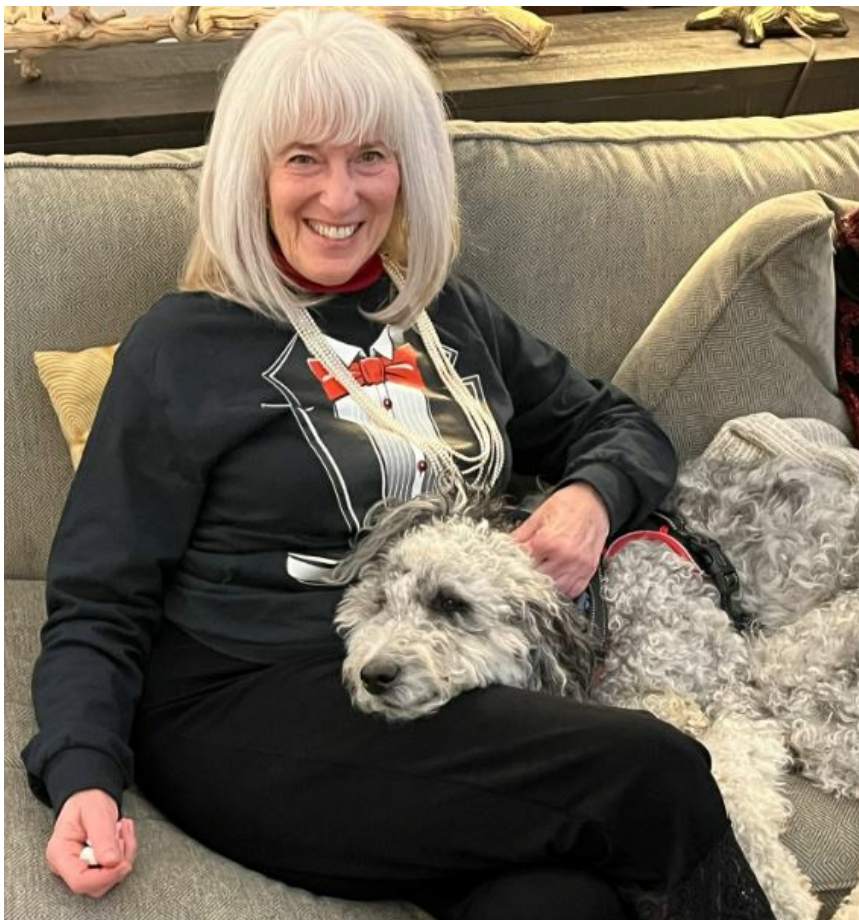
D. I hosted two BLAINESWORLD webcasts this past week. You can listen to and/or view both on the indicated dates at Here .