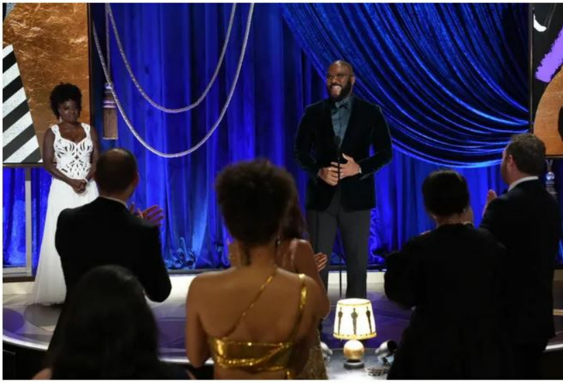
Viola Davis listens as Tyler Perry accepts the Jean Hersholt Humanitarian Award.