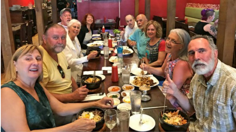
(3) And we liked out tasty meal at Papas Pizza in Leicester.