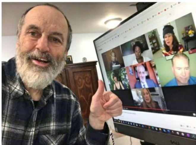
C. I was on twice this past week on WPVM.

(1) Catch my regular BLAINESWORLD show by clicking: Here .