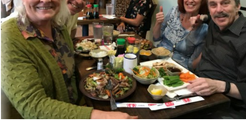
(3) Had a tasty dinner at Nachos & Beer, a Tex-Mex restaurant located just down the road from us.