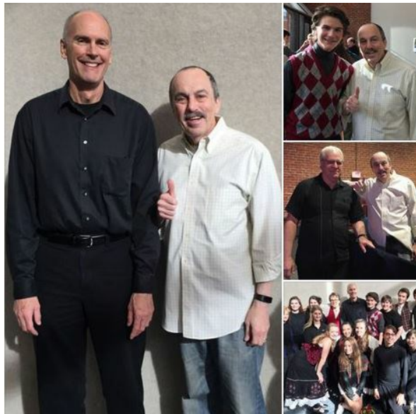
D. Condolences to: