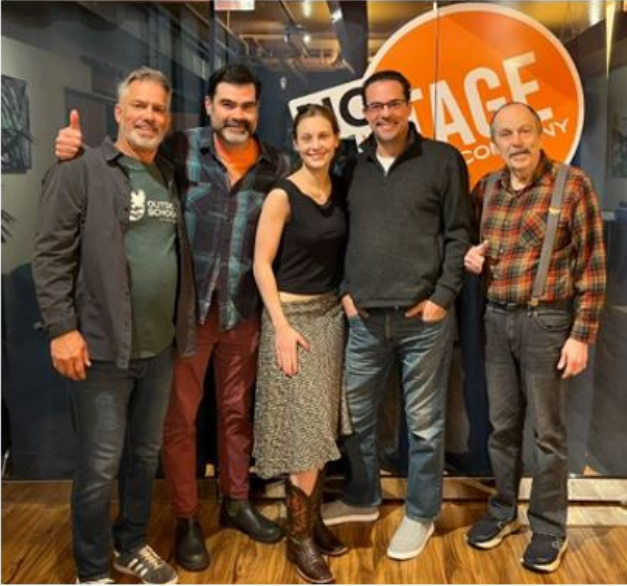
Post-show smiles after a gripping performance

D. I hosted three webcasts this past week. All can be heard and/or seen at: