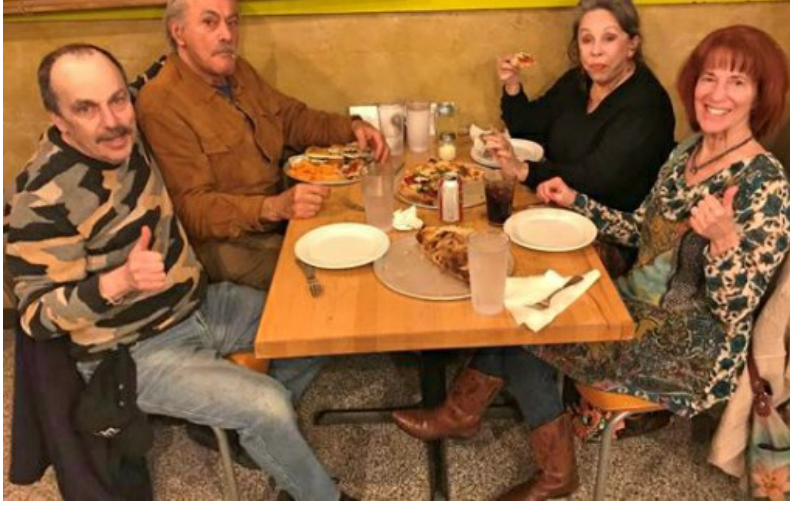
(3) Had a terrific dinner at Iannucci's Pizzeria & Restaurant. The portions were huge, and the food was excellent--and so was the service we received from Sky.