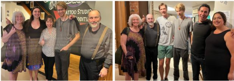
C. I then was fortunate to be able to attend Show A of the Festival on another afternoon.