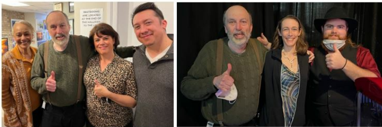
D. During healthier times, we had a tasty meal at the East Village Grille.